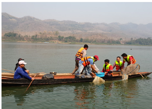
Participants of JEM Pilots fisheries training February 2020, Luang Prabang, Lao PDR