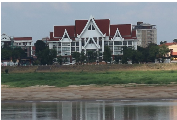
Lower Mekong mainstream in front of MRC secretariat

In 1995, Cambodia, Lao PDR, Thailand and Viet Nam established the Mekong River Commission (MRC) as a mechanism for addressing the development opportunities and challenges of the Lower Mekong Basin.